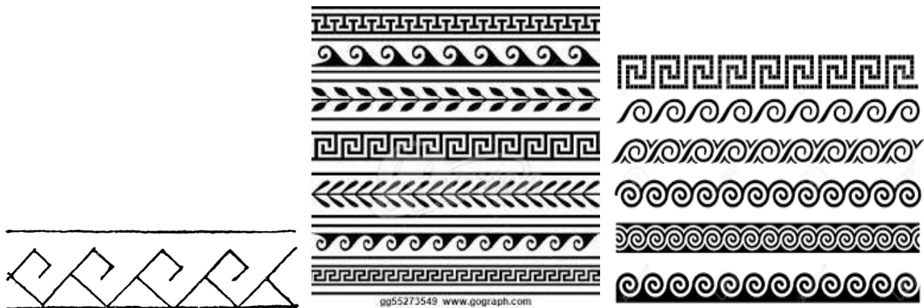
Possible border ideas